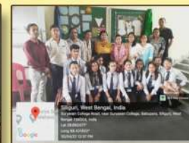
E. Publication of 3rd edition of Wall Magazine by 6th semester (Hons.) students : Essence of Auditing on 30.05.2022